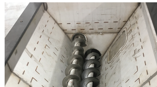
Stainless-steel construction ensures cleanliness, low maintenance, no rust and a long life span.

Regulations are constantly increasing and landfill diversion strategies are becoming mandated. In the search for solutions, the Tiger Depack System delivers an easy, efficient and cost-effective solution for managing multiple volumes of food and organic waste on a compact footprint.