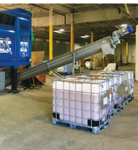
dry organic discharge