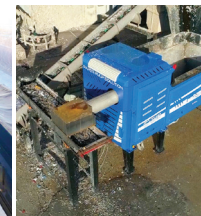
paper pulp recovery