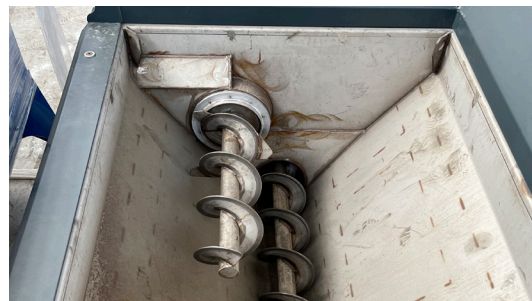
An auxiliary feed auger eliminates product bridging by reversing at programmable timed intervals.