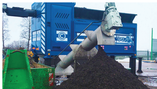
A high-speed vertical mill with bolt-on paddles extracts organics via centrifugal force.