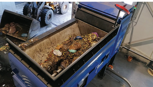
Feed, separate, process and extract organic and inorganic material in a single pass.