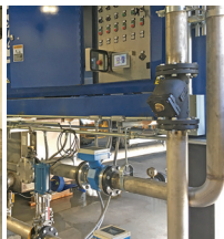
wet organic discharge