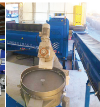
conveyors and auger