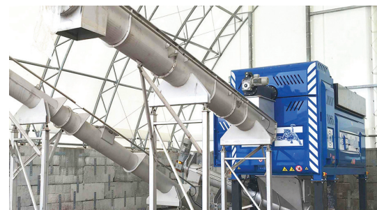
Instantly change between wet or dry organic discharge with programmable water content.