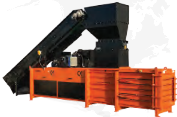
CK600HFE FULLY EJECT