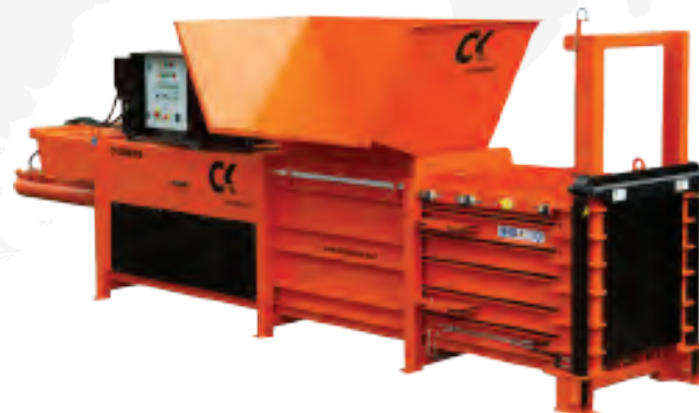
CK600HFE.PC FULLY EJECT WITH PORTCULLIS