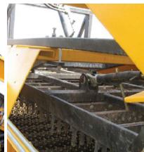
automatic deck cleaner