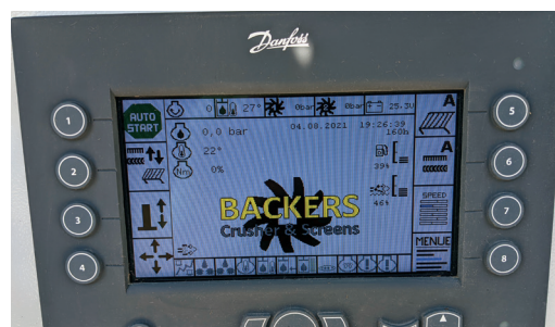
The precision control system allows the right product to be produced at the right level.