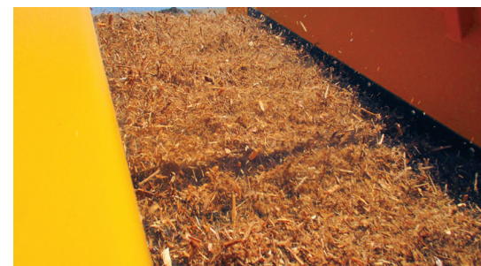
Heavy-duty stars agitate material to maximize production in wet conditions.