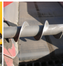
auger in hopper