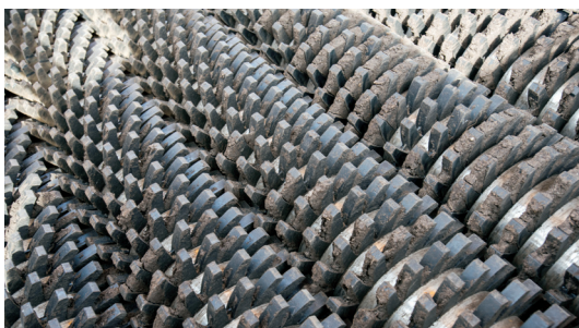
A four-bolt system connects the shaft and stars, creating stability and improving shaft tolerance.

Backers three-fraction star screens are highly maneuverable, and are available on stationary, wheeled, tracked, or our exclusive wheeled/tracked chassis. For ultimate flexibility and throughput, Backers three-fraction star screens are unmatched.